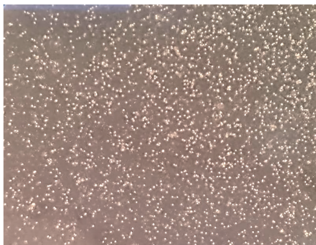
Figure 1. Calculation of cell density using hemacytometer; viable cells appear white with an intact round morphology

The PBMCs were isolated using the density gradient centrifugation technique with a Ficoll solution. The centrifugation process produced a cloudy annulus between the plasma and Ficoll layers containing PBMCs. A mononuclear cell culture was maintained for three days. Then, SARS-CoV-2 subunit S1 spike protein was stimulated and incubated for 24 hours. The mean value of viable cells was 9.45 \times 10^5 PBMCs/mL (Figure 1).