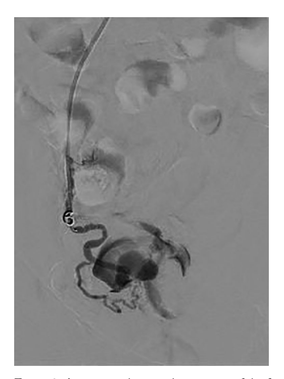
Figure 3. Angiogram showing the insertion of the first embolization coil