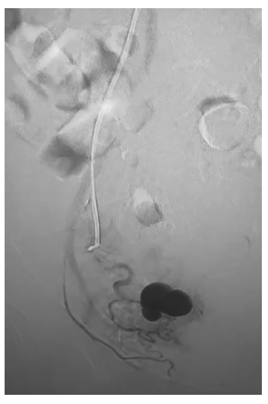
Figure 2. Preinterventional selective angiogram showing active bleeding (contrast leakage) from the right uterine artery

She was immediately admitted to the interventional radiology unit where emergency uterine artery angiography was performed. The procedure identified a clear bleeding source from the right uterine artery (figure 2) and was followed by insertion of 2 metallic coils with subsequent cessation of the bleeding (figures 3,4). Mean intervention time was about 20 minutes.