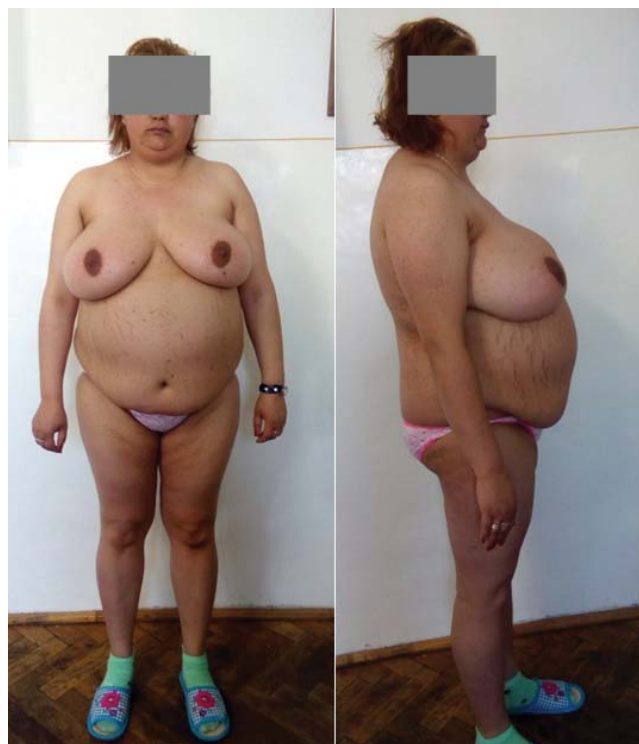
Figure 1A,B. Clinical presentation of a female patient diagnosed with Cushing' disease: central distribution of adipose tissue, supraclavicular fat pads, buffalo hump and purple-red striae on the lower abdomen.

The hormonal profile showed high levels of serum cortisol and UFC, broken cortisol circadian rhythm,