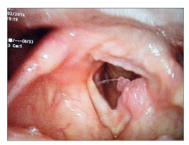
Figure 5. Flexible endoscopic exam using normal white light - laryngeal papillomatosis