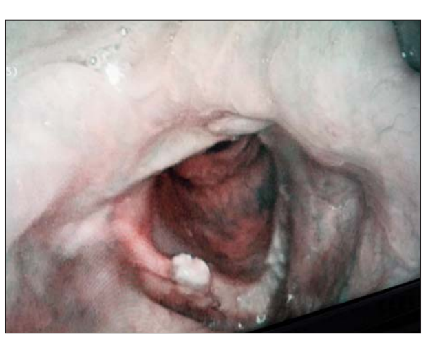
Figure 4. Flexible endoscopic exam using NBI - cronic laryngitis with hiperkeratosis