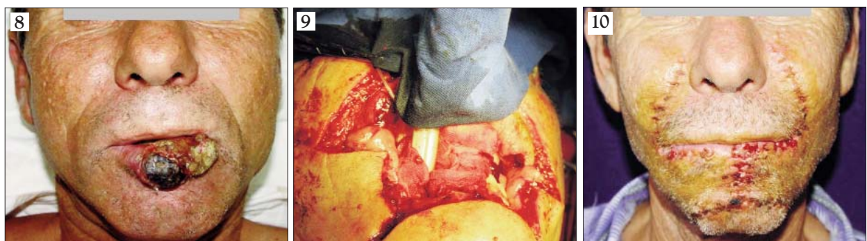
Figure 8-10. Modified Camille Bernard technique with a barrel line around the chin tegument incision