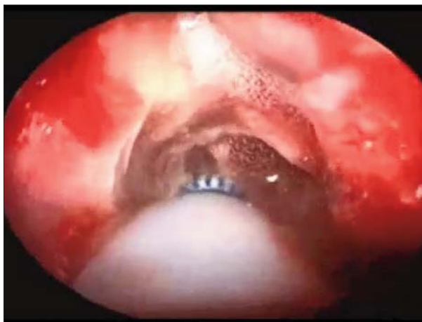
Figure 2. Endoscopic view – The ultrasonic aspirator in the right sphenoid sinus

important asymmetry of the face because of an important fibrous dysplasia lesion, located at the left arch of the mandible. That lesion was removed using the ultrasonic aspirator, set on the bone removal program. A 25 kHz tip probe was used to remove all dysplastic bone, sparing the mandibular nerve. Because the remaining bony tissue was too thin, the danger of mandibular fracture was present, so a mandibular titanium plate had to be set in place using titanium screws. The osseointegration of the plate was normal.